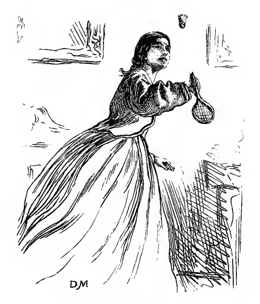
Battledore and Shuttlecock.